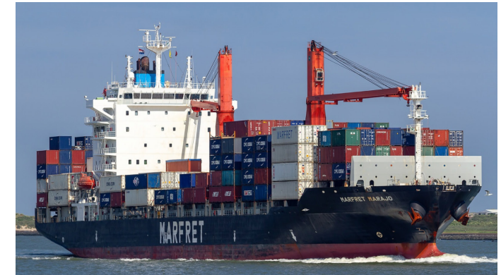
HYUNDAI Shipyard Hull N° S392 Delivery Sept. 2008