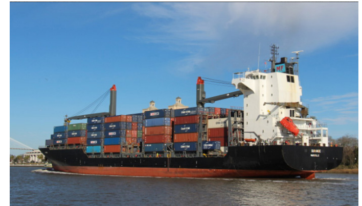
Guangzhou Wenchong Shipyard (China) Hull N° GWS 292 - Delivery 2003